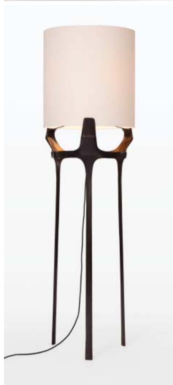
Flint Floor Lamp 54.5 x 175cm