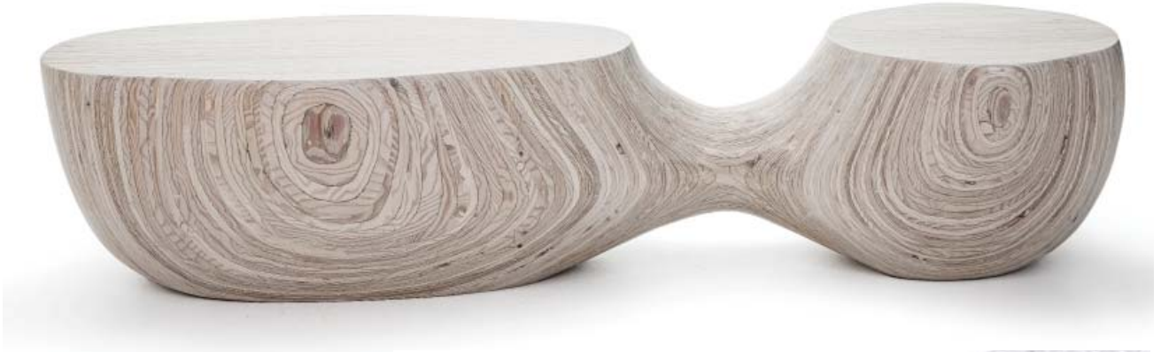
Pouf Bench/Table 195.5 x 43 x 43cm

Finishes selected for a number of the pieces to be shown by Willer vary from those illustrated.