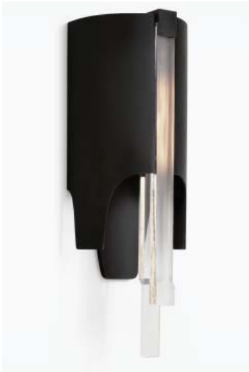
Fortine Sconce 50 x 8 x 13cm