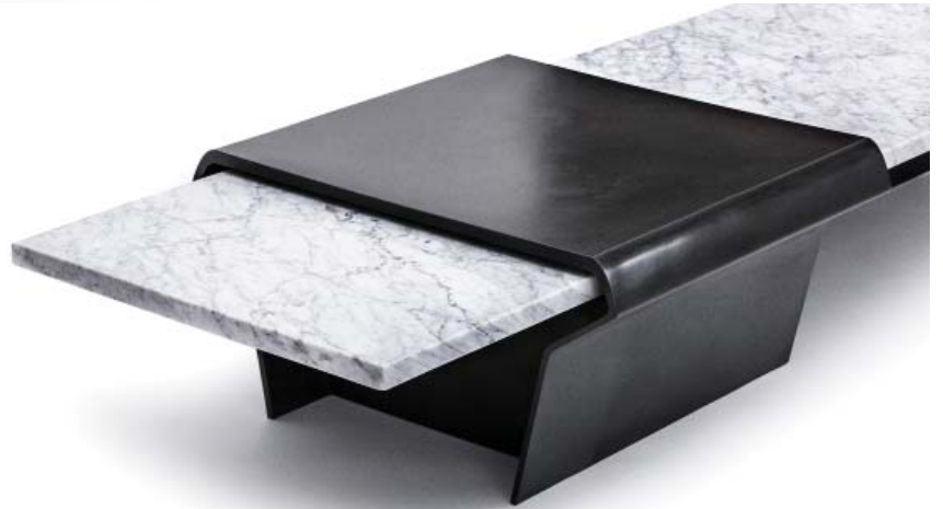
Nissler Coffee Table 206 x 63 x 35cm