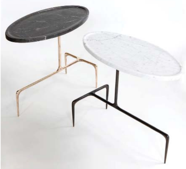
Bridger Oval Occasional Table 48 x 25.5 x 42cm

Finishes selected for a number of the pieces to be shown by Willer vary from those illustrated.