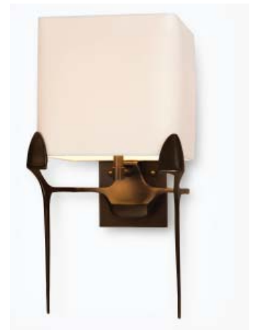
Flint Sconce 20 x 24.5 x 44cm