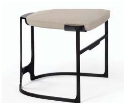
Volt Stool 56 x 48 x 44.5cm