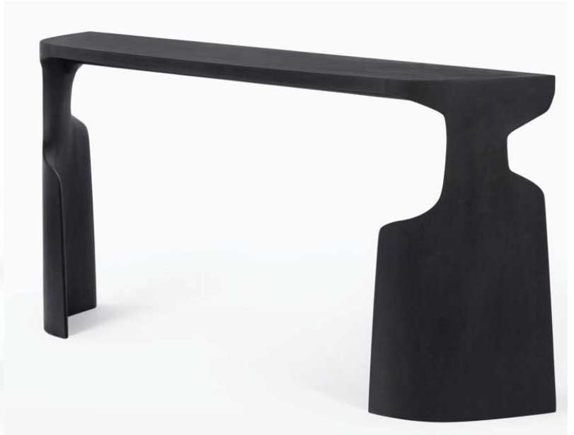
Pryor Console 182 x 35.5 x 81cm