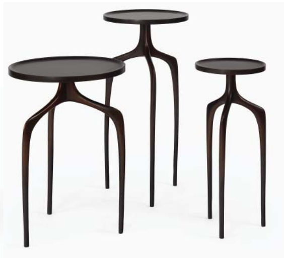
Bridger Cast Bronze Tables 1: 20 x 49.5cm | 2: 28 x 61cm | 3: 33 x 49.5cm