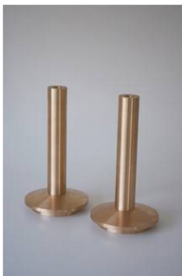
Lighthouse Candlesticks, Michael Verheyden

Both these selling shows are a dream of combination of rational aesthetics and perfect craftsmanship: which not only makes them an easy, highly sophisticated fit within almost any interior, but also a safe bet for anyone looking for an investment piece.