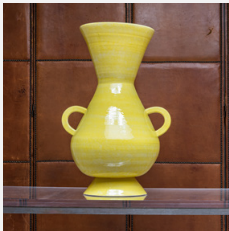
VASE II – 2019