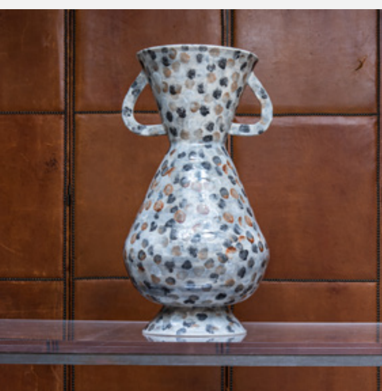
VASE IV – 2019