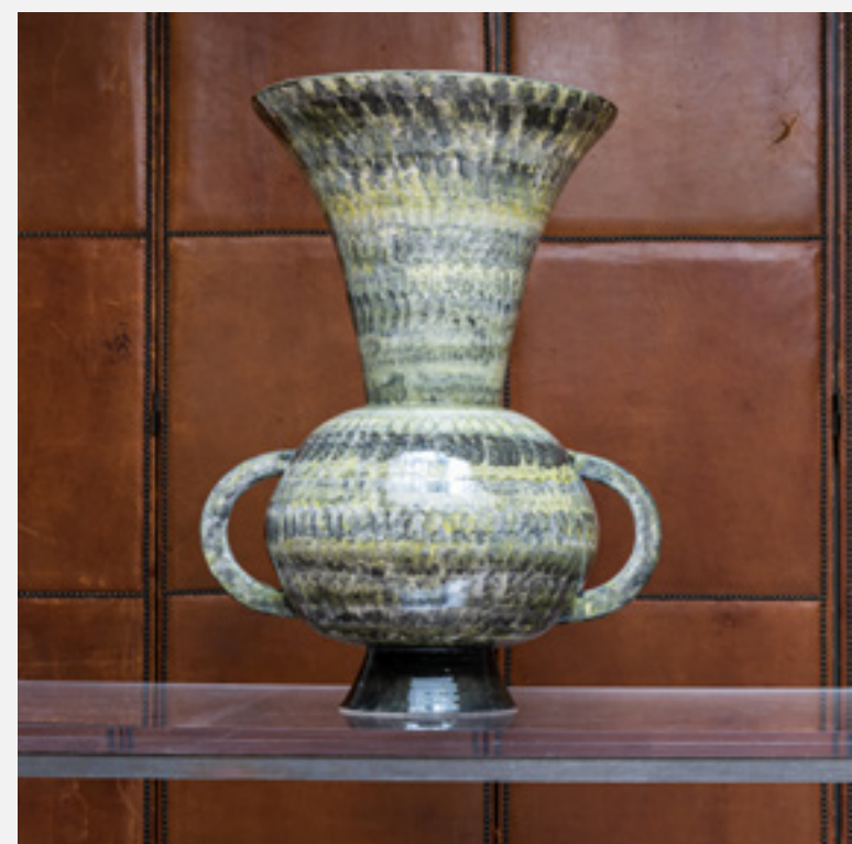
VASE III – 2019