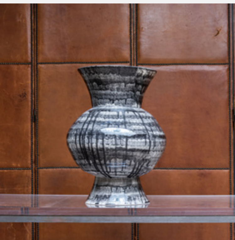
VASE I – 2019